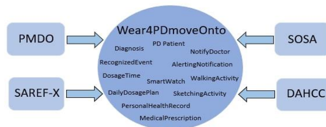
Figure 2: Reused ontologies in Wear4PDmove ontology

The proposed Wear4PDmove ontology captures knowledge of PD patient monitoring, integrating movement data with PHR data for real-time event recognition and alerting. The ontologies we reuse (Figure 2), such as DAHCC [11], SOSA [12], SAREF [13], SAREF4WEAR [14], and PMDO [15], provide a solid foundation for representing various aspects of sensor and PD-related data, and knowledge about wearables in the context of healthcare monitoring, which aligns with our objectives. While SNOMED-CT is an essential healthcare terminology widely used in the medical domain, our primary goal is to leverage existing ontologies that specifically address the challenges and intricacies of PD patient monitoring and alerting. Nevertheless, we acknowledge the importance of SNOMED-CT and other related healthcare ontologies in broader healthcare contexts, and their potential relevance for interoperability and data integration beyond the scope of the Wear4PDmove ontology [10].