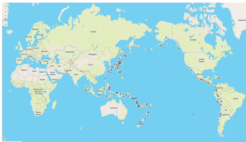
Figure 2: Hypocenter map from 2010

the availability of an earthquake catalog format that can be used as earthquake data and learning data, and LOD conversion of data observed by our own observation network. Benchmarking based on the same dataset is important for source determination, calculation of predicted seismic intensity, and training data for machine learning, but it is believed that datasets for reproduction are not distributed due to the fact that Japanese data cannot be redistributed and IDs are not assigned. By using the earthquake ontology created in this paper to describe the datasets used in earthquake research in LOD, it is expected that the availability of datasets for reconstruction will be improved.